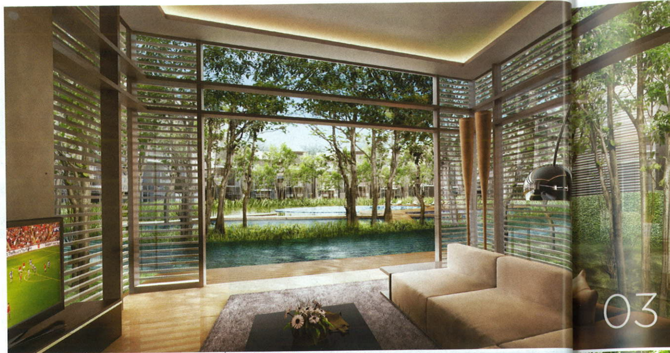
03 Lake villa living hall view 04 Luxurious lake villa 05 Aerial view of Mirage by the lake